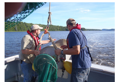
Scientists prepare to remove fish from live well of surface trawl in Penobscot Bay.